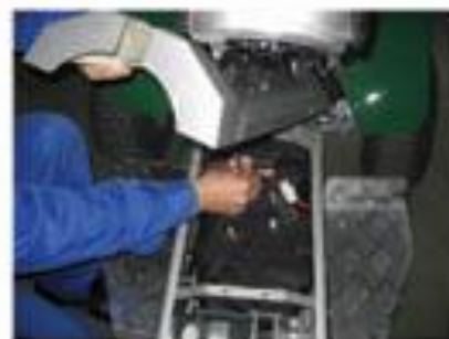
4. Take out battery for recharge, or they can be charged in golf cruiser.