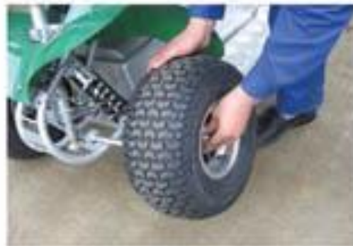
1. Assemble front 2 wheels