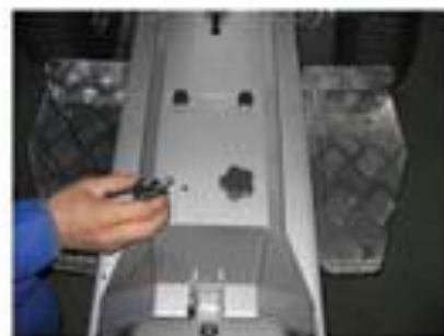
3. Unscrew the two screws and open the battery case, disconnect the two charger plugs.