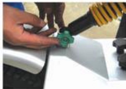
3. Assemble suspension