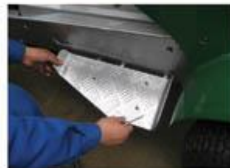
4. Tighten foot rest