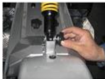
1. Unscrew the fast release rear suspension.