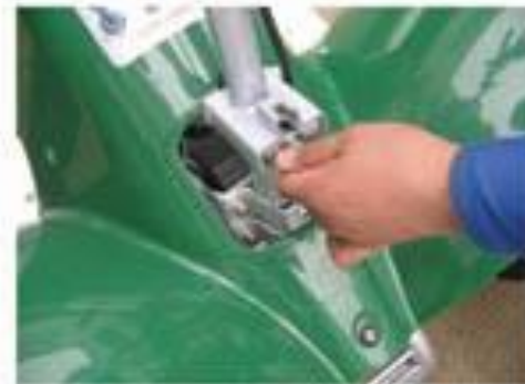
2. Assemble T bar