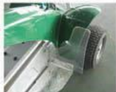
Front mud guard